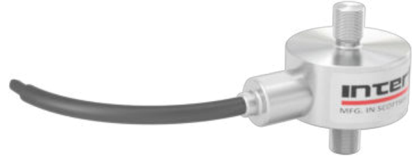
Model WMC-5K (Shown)