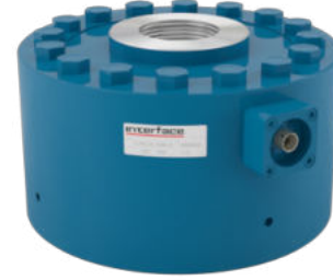
Model 1240ACK-200K (shown)