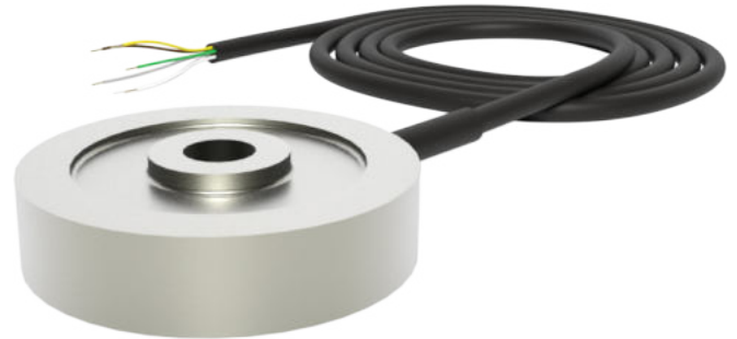
Model LWHP14-5kN (Shown)