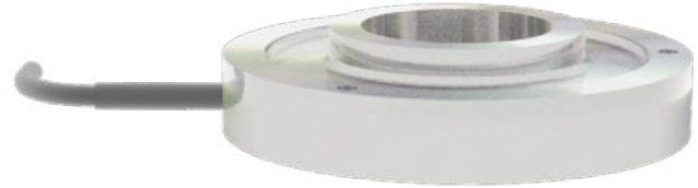
Model LWMH2 (Shown)