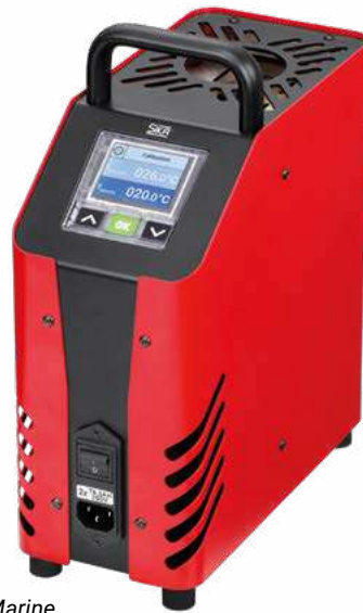
TP Basic Marine

TP Basic // Dry block // RT...650 °C // RT...1202 °F