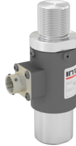
Model REC-5K (Shown)