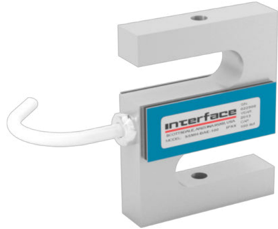
MODEL SSM-FDH (Shown)