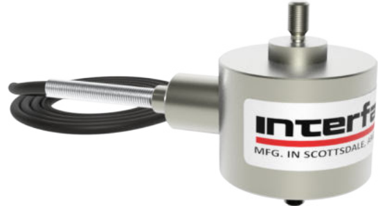
Model WMCP - 1000G (Shown)