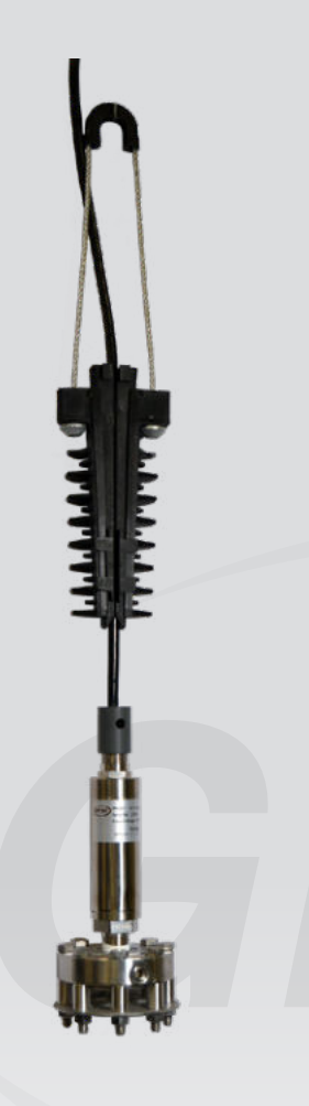
Model BCH2000 Cable Hanger