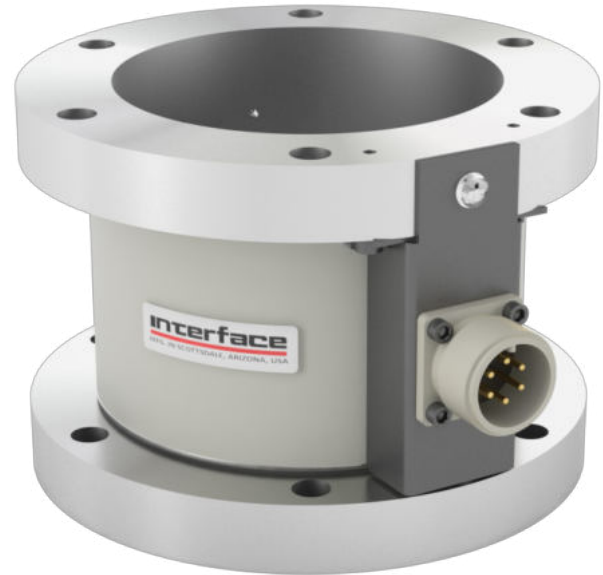
MODEL 5330 (Shown)