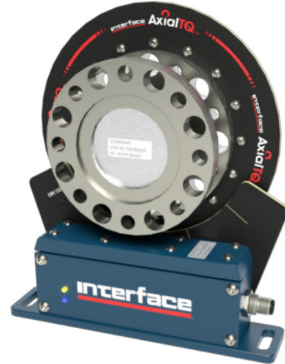
Model ATQ10D12-01KEX (Shown)