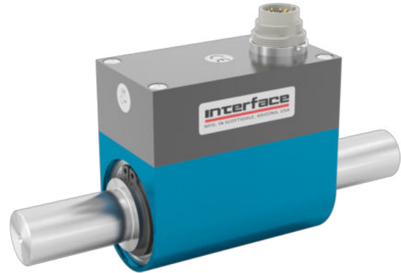
MODEL T6 (Shown)